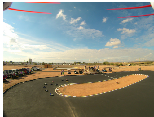
The completed R.C. Cars track.

There will be a seminar on Feb 14, 2015, from 9-11am in the Card Room. This vitally important class may save your life or that of your loved ones. Make time in your schedule for this!!