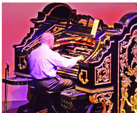
Organ Stop Pizza Tag-A-Long on Jan 22, 2015